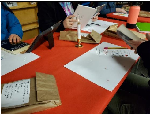
The "dates" were covered with a brown bag. The tag on the front gave a sneak peek of their personality. Students walked around the "restaurant" reading the tags & chose the date they found most interesting.