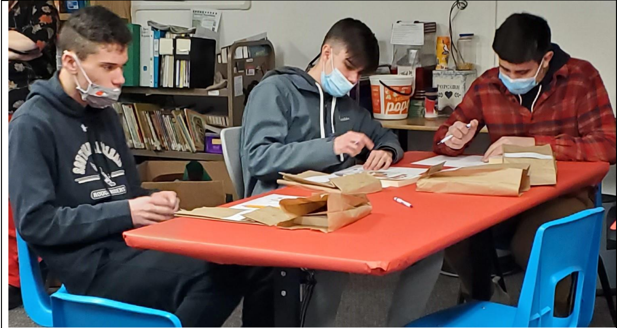
Some Junior boys rating their dates