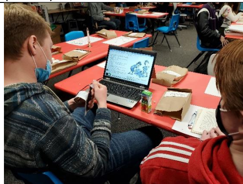
Some of our dates joined us virtually (AKA Digital Book Titles).