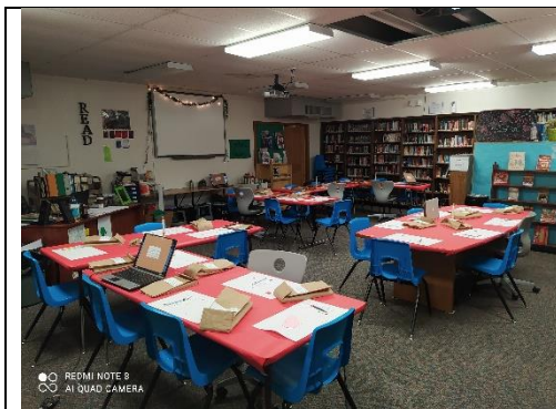
A romantic restaurant, dates at the ready, soft lighting, and candlelight all set the mood for our Blind/Speed Date Book Tasting.