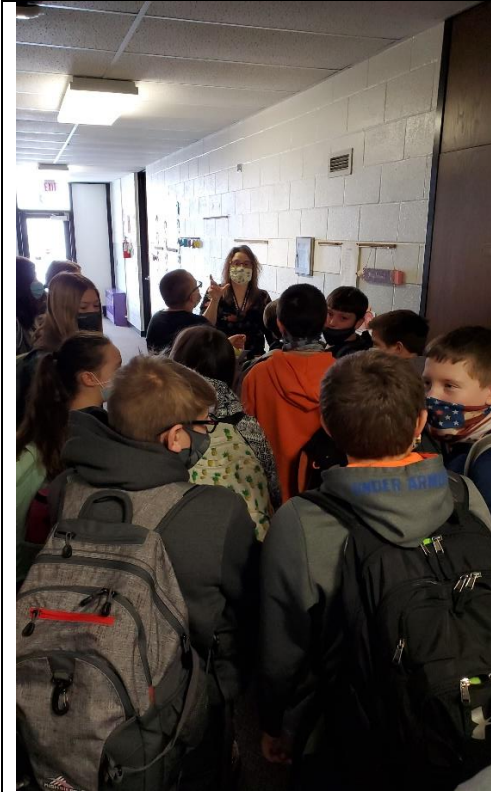
7 th Grade party of 22? Your dates are ready and waiting!